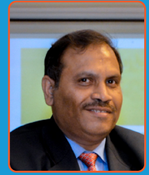
Mukul Roy Nicholas Piramal